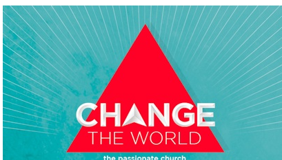
CHANGE THE WORLD - the passionate church Thursday & Friday, March 16 & 17, 2017