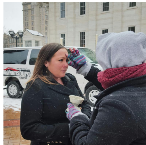
ASHES to GO - Ginghamburg Wednesday, March 1st