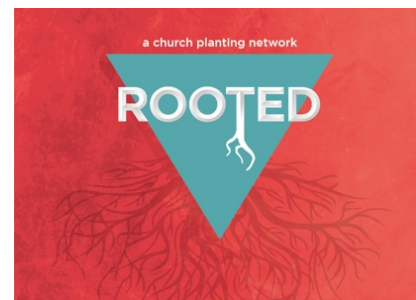
ROOTED - a church planting network Tuesday & Wednesday, March 14 &