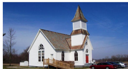
TAARP: SAFETY & SECURITY IN THE CHURCH – plus – THE DIFFICULTIES OF OPIATE